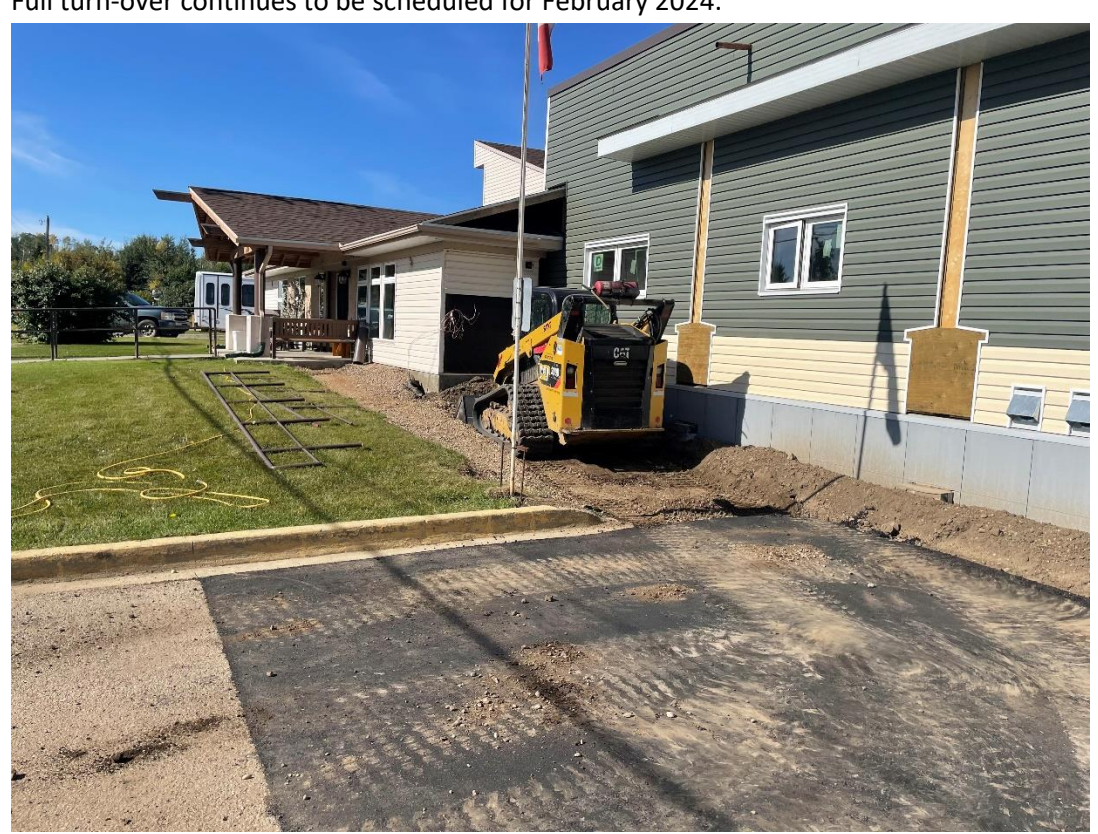
Full turn-over continues to be scheduled for February 2024.