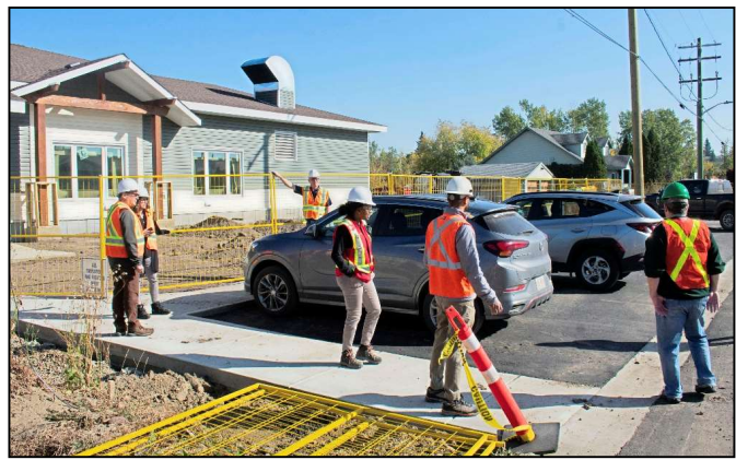
The Del-Air Lodge redevelopment will accommodate 16 designated supportive living units.